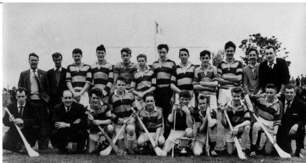
2013 marks the 50th anniversary of the first Ruairí Óg hurling team to win an all-county championship title. More about this team to come in the months ahead.